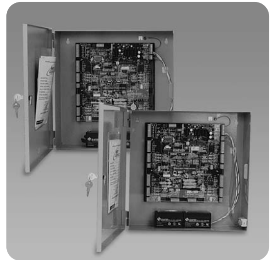
ACURT2 & ACURT4