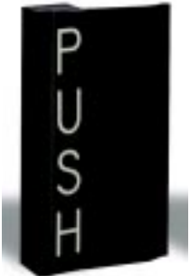
TSH-BK Satin Black Finish