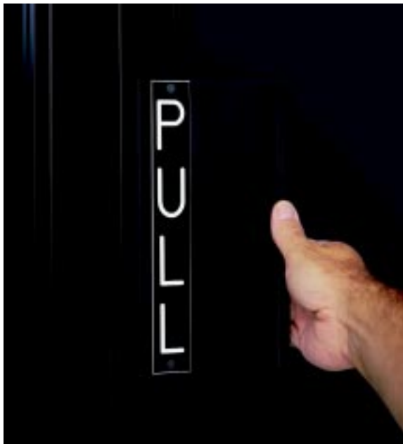
Model TSH-BK mounted on an inswinging aluminum frame glass door.

Many applications call for controlled entry from the outside of the door and free egress from the inside . Use of the Touch Bar or Touch Handle as the egress device makes this simple, safe and reliable. The units each have a double pole relay output . The NC contacts are wired to directly break power to the magnetic lock when the unit is touched. The NO contacts connect to the REX ( request to exit ) terminals in the access system controller so that no alarm event is created during free egress. Extra safety is achieved because in the event of a failure in the access control system, the Touch Bar or Touch Handle will still directly release the lock. This "double break" approach is increasingly being mandated in U.S. building codes.