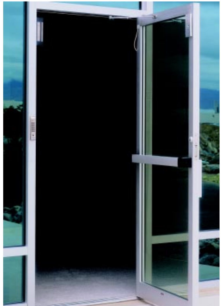
Typical installation on aluminum frame glass door with Model 62 Magnalock®, DK-26SS Digital Entry and TSB-3CL Touch Sense Bar.

The Touch Sense Handle is sized to cover up existing mounting holes used for standard pulls on aluminum doors. It is employed to pull open inswinging doors or as an alternate push-open device for outswinging doors which provides a different look on aluminum frame glass doors. The Touch Sense Handle includes two legend plaques which state PULL or PUSH or which may be reversed to show a black or